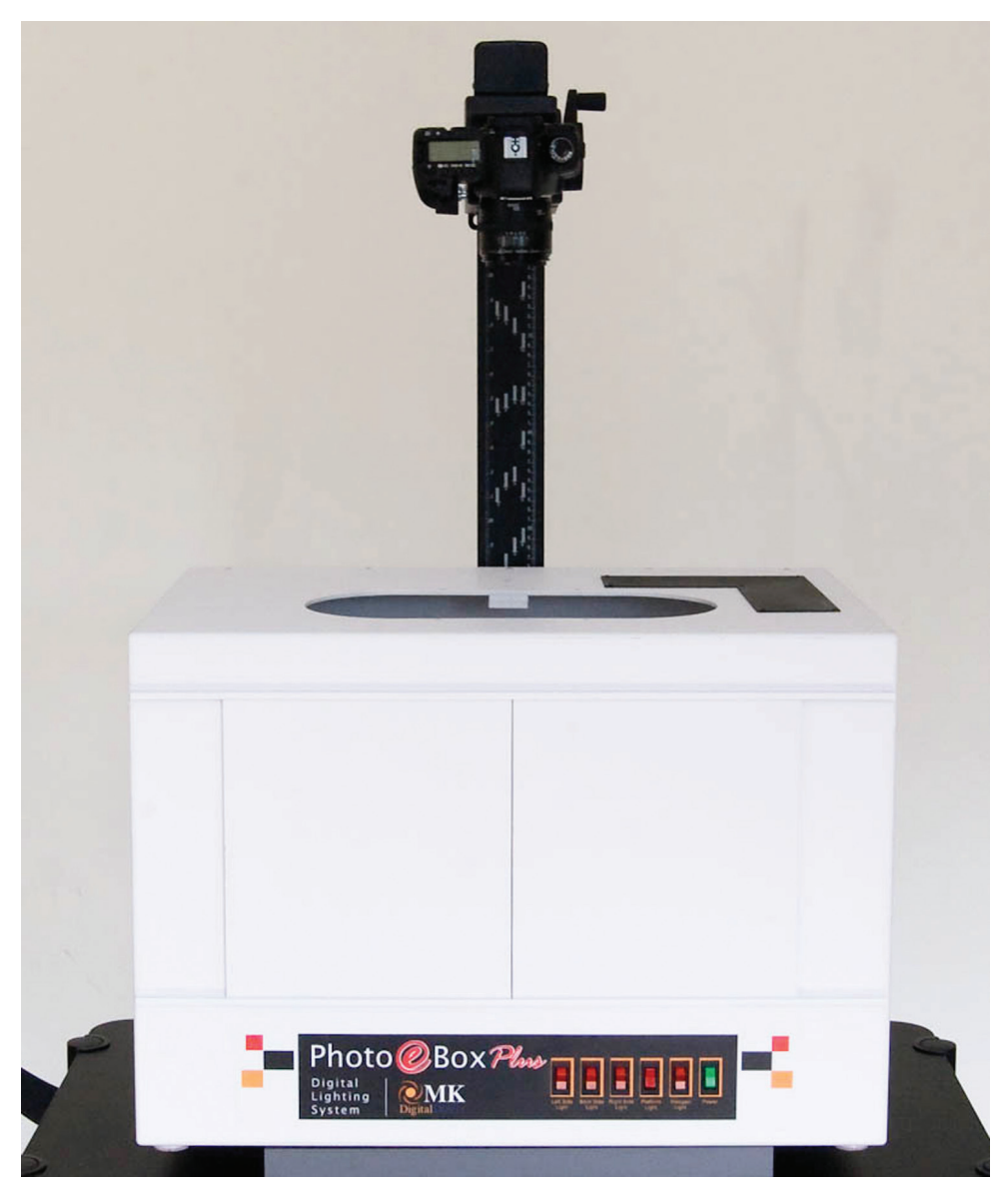
Figure 2. NYBG imaging station consisting of a Canon Eos 5D Mark II digital camera body, a Canon EF 50mm f/2.5 Macro lens, Photo e-Box Plus 1419 from MK Direct, and Kaiser RS 1 copystand.

tion, all imaging workstations are configured identically in order to produce consistent images. The white balance of individual cameras may be manually modified to account for subtle differences in the color temperature of the lights.