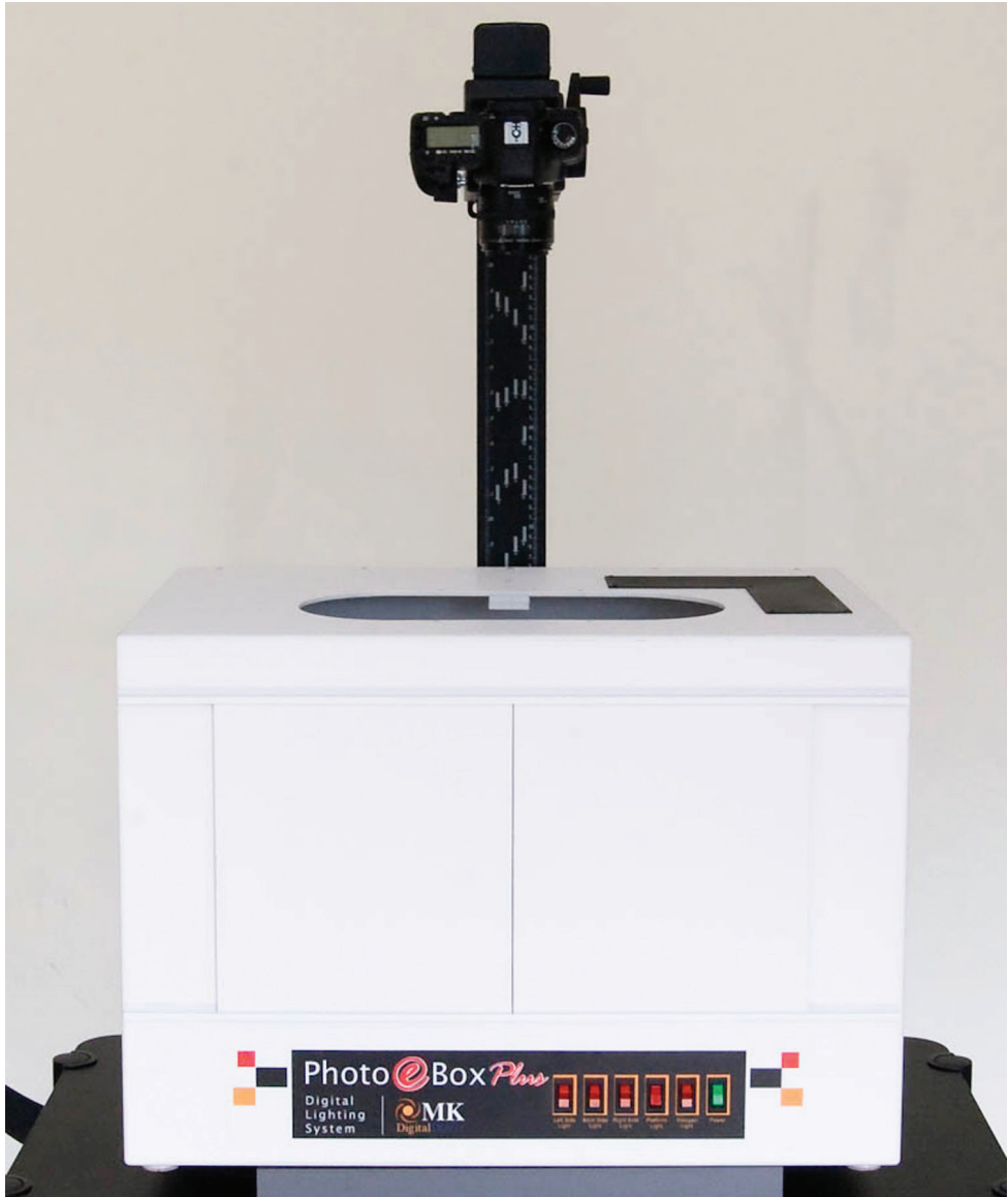
Figure 2. NYBG imaging station consisting of a Canon Eos 5D Mark II digital camera body, a Canon EF 50mm f /2.5 Macro lens, Photo e-Box Plus 1419 from MK Direct, and Kaiser RS 1 copystand.

tion, all imaging workstations are configured identically in order to produce consistent images. The white balance of individual cameras may be manually modified to account for subtle differences in the color temperature of the lights.